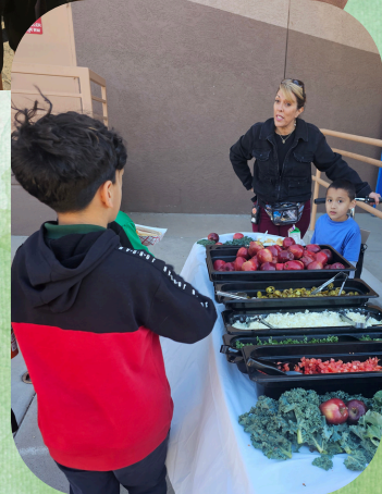
STARLIGHT PARK PREPATORY