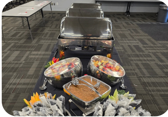
ADMIN MEETING BREAKFAST